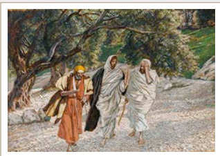
COVER - James TISSOT ( Nantes, France, 1836–1902, Chenecey-Buillon, France). The Pilgrims of Emmaus on the Road ( Les pèlerins d'Emmaüs en chemin), 1886–1894. Opaque watercolor over graphite on gray wove paper, Image: 18.9 x 27 cm. Brooklyn Museum, Purchased by public subscription, 00.159.338